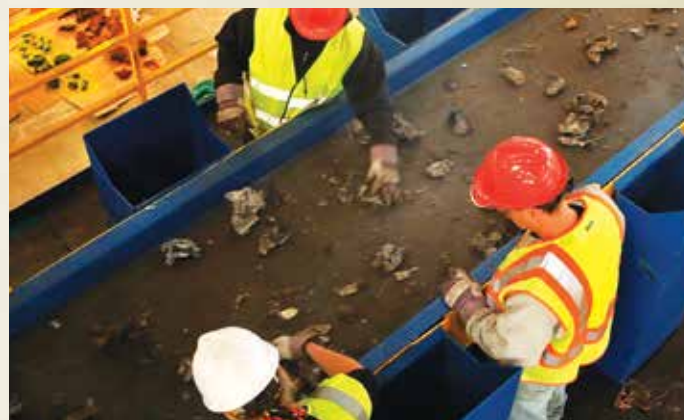
Tradition #2 quality ferrous fraction.