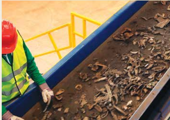
Premium #1 quality shred with less than .20% copper content.